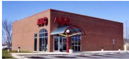
102 Durwood Ct, Reidsville NC

The last performance audit for the Reidsville ABC Board occurred in 2022. The Commission audit serves as a continuous way to provide local boards with information and best practices that target areas for improvement.